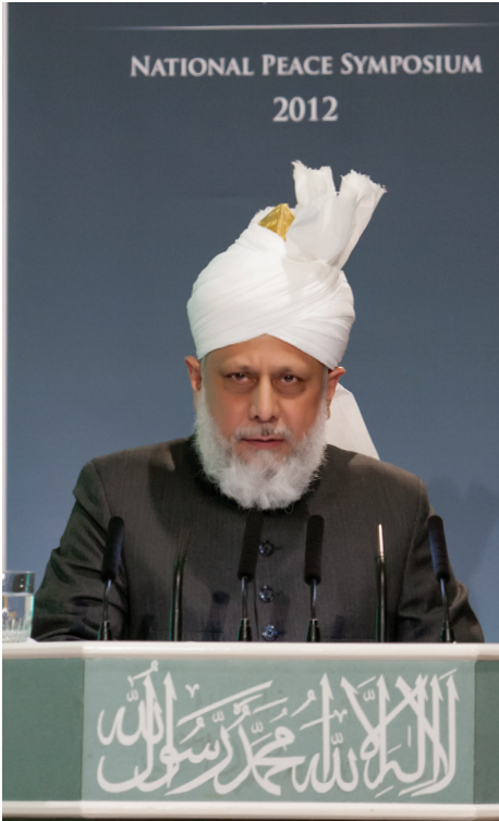
Ḥaḍrat Mirza Masroor Ahmad, Khalifatul-Masih V aba addressing the 9th Annual Peace Symposium