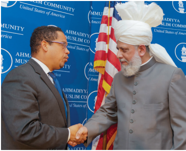
The first Muslim Congressman, Keith Ellison meeting Ḥaḍrat Khalifatul-Masiḥ V aba