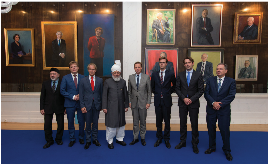
Members of the Standing Committee for Foreign Affairs at the Netherlands National Parliament with Hadrat Khalifatul-Masih V aba