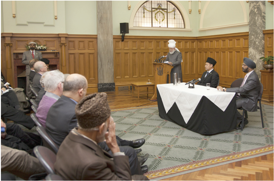
Hadrat Khalifatul-Masih V aba delivering the keynote address at the Grand Hall, in the New Zealand Parliament. 4th Nov 2013