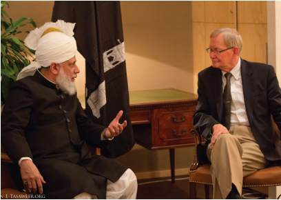
Tunne Kelam (MEP Estonia & Vice-Chair of European Parliament Friends of Ahmadiyya Muslims Group) meeting with His Holiness