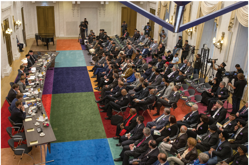
Hadrat Khalifatul-Masih V aba at a special session of the Standing Committee for Foreign Affairs at the Netherlands National Parliament.