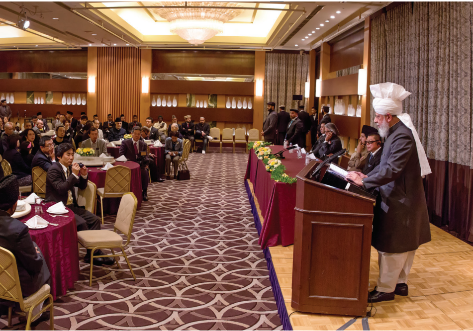
Hadrat Khalifatul-Masih V aba delivering keynote address at a special reception in Tokyo, Japan.