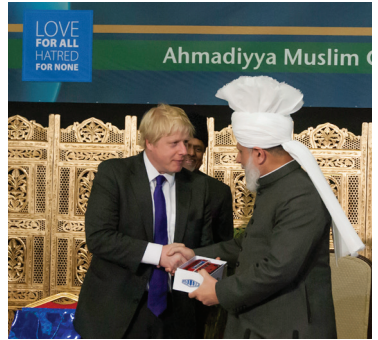
Mayor of London Boris Johnson presenting His Holiness with a London bus souvenir