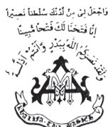
MIRZA MASROOR AHMAD HEAD OF THE AHMADIYYA COMMUNITY IN ISLAM

بِسْمِ اللَّهِ الرَّحْمَنِ الرَّحِيمِ نُحْمَدُهُ وَنُصَلِّي عَلَى رَسُولِهِ الْكَرِيمِ وَعَلَى عِبْدِهِ الْمَسِيحِ الْمَوْعُودِ خدا کے فضل اور رحم کے ساتھ هوالتناصر