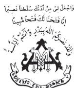
MIRZA MASROOR AHMAD HEAD OF THE AHMADIYYA COMMUNITY IN ISLAM

بِسْمِ اللَّهِ الرَّحْمَنِ الرَّحِيمِ نَحْمَدُهُ وَنُصَلِّي عَلَى رَسُولِهِ الْكَرِيمِ وَعَلَى عِبْدِهِ الْمَسِيحِ الْمَوْعُودِ خدا کے فضل اور رحم کے ساتھ هوالتناصر