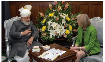
The Home Secretary, Rt. Hon. Theresa May MP with Hadrat Khalifatul-Masih V aba