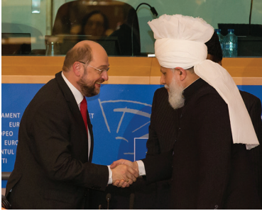
Haqdar Khalifatul-Masih V ab being welcomed by Martin Schulz, President of European Parliament