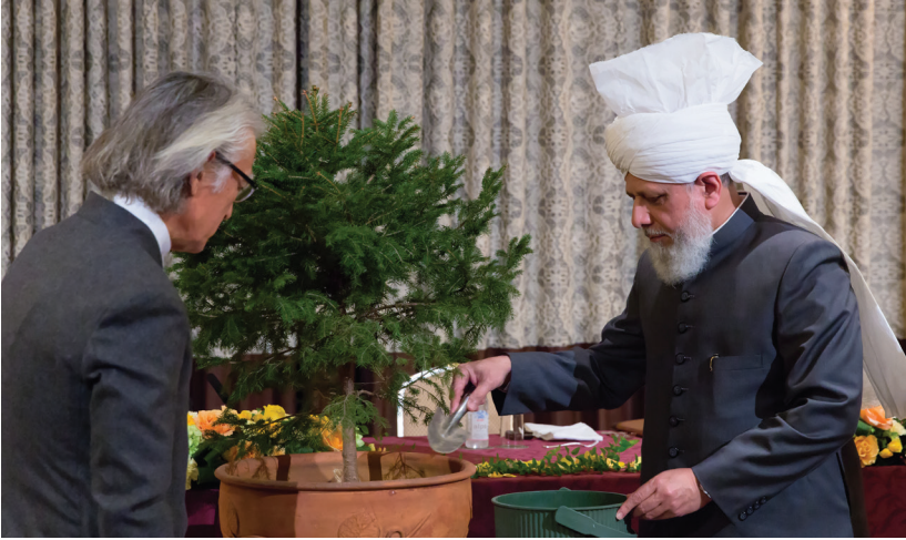
Hadrat Khalifatul-Masih V aba watering a plant at a special reception in Tokyo, Japan.