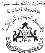
MIRZA MASROOR AHMAD HEAD OF THE AHMADIYYA COMMUNITY IN ISLAM

بِسْمِ اللّٰهِ الرَّحْمٰنِ الرَّحِیْمِ نُحَمِّدُهٗ وَنُصَلِّیْ عَلٰی رَسُوْلِهِ الْكَرِیْمِ وَعَلٰی عِبْدِهِ الْمَسِیْحِ الْمَوْعُوْدِ خدا کے فضل اور رحم کے ساتھ هوالتناصر