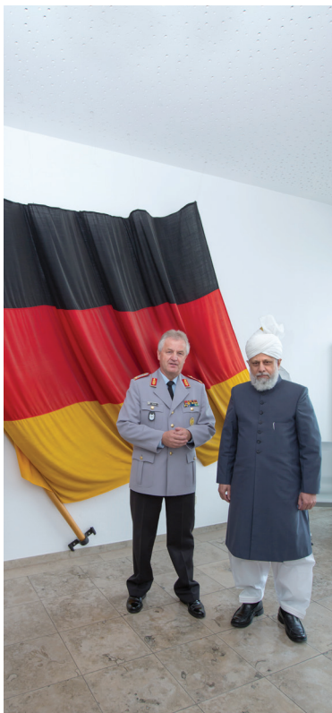
Brigadier General Alois Bach of the German Federal Army with Ḥaḍrat Khalifatul-Masiḥ Vḥba