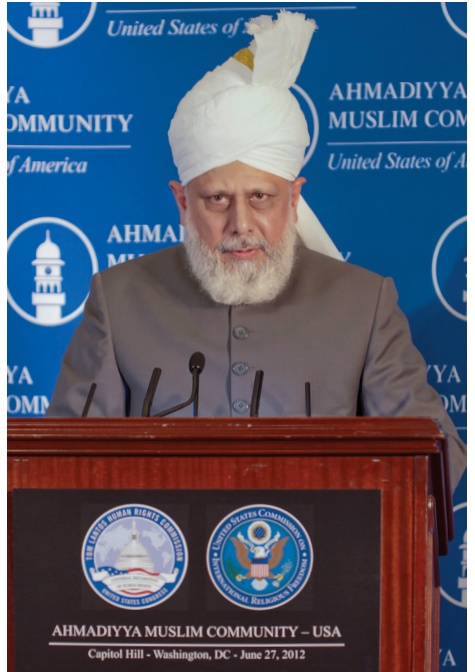
Ḥaḍrat Mirza Masroor Ahmad, Khalifatul-Masiḥ V aba delivers his keynote address at U.S. Capitol Hill