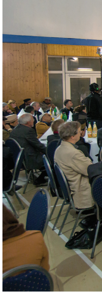
Haqrat Mirza Masroor Ahmad, Khalifatul-Masih V zhs delivers the keynote address at Baitur-Rasheed Mosque