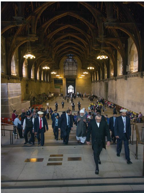
Rt. Hon. Ed Davey MP escorts Hadrat Khalifatul-Masih V iba through Westminster Hall, House of Commons, London, 11th June 2013