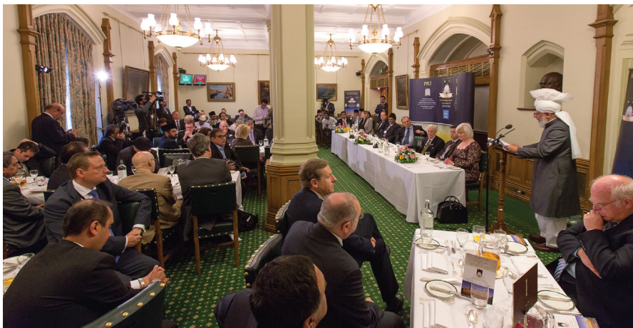
Hadrat Khalifatul-Masih V iba delivering his historic speech to Parliamentarians, VIPs and diplomats at the House of Commons, London, 11th June 2013