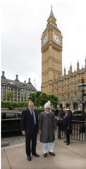
Hadrat Khalifatul-Masih V iba received at the House of Commons by Rt. Hon. Ed Davey MP London, 11th June 2013