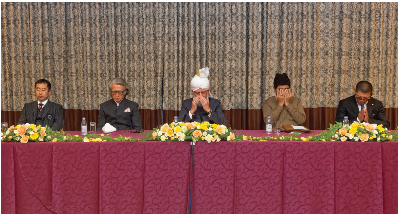
Hadrat Khalifatul-Masih V aba leading silent prayer at a special reception in Tokyo, Japan.