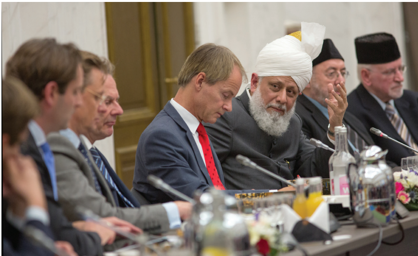
Hadrat Khalifatul-Masih V aba answering a question about a range of political and religious issues.