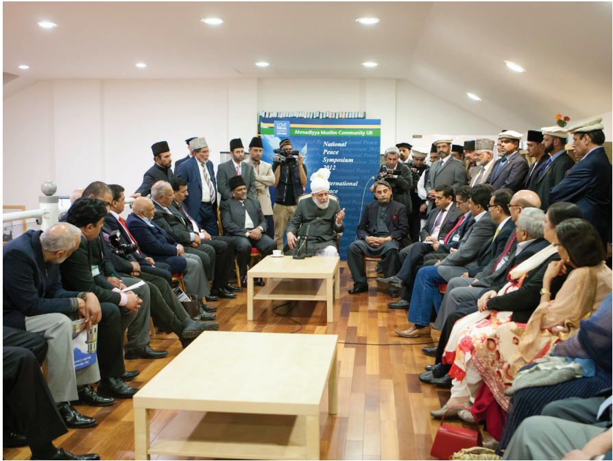
Ḥaḍrat Mirza Masroor Ahmad, Khalifatul-Masiḥ V ḥ talking to the overseas Pakistani press regarding world affairs