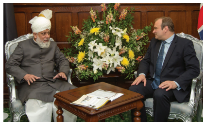
Rt. Hon. Ed Davey MP with Hadrat Khalifatul-Masih V aba