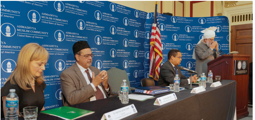
Ḥaḍrat Mirza Masroor Ahmad, Khalifatul-Masiḥ V aba leading silent prayer at U.S. Capitol Hill