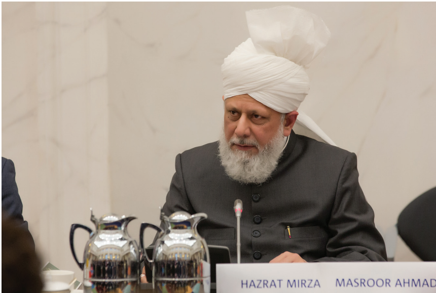
Hadrat Khalifatul-Masih V aba delivering his historic address at a special session of the Standing Committee for Foreign Affairs at the Netherlands National Parliament.