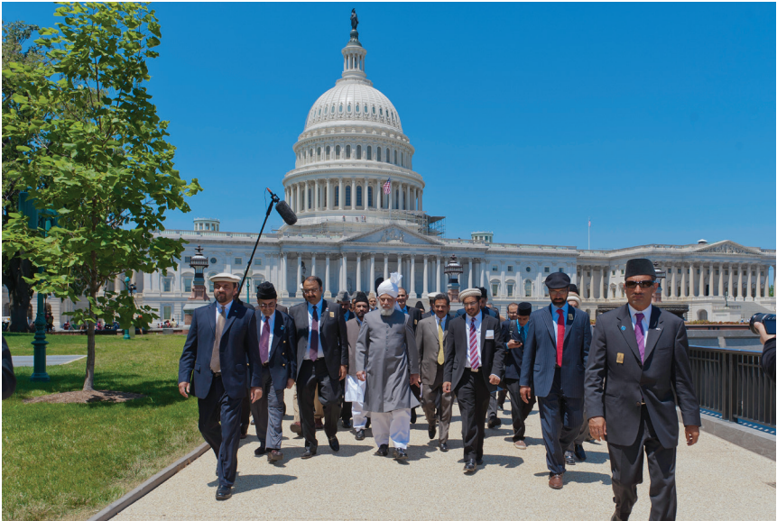
Ḥaḍrat Khalifatul-Masiḥ V rah in U.S. Capitol Hill after his historic address to the US Statesmen and Bureaucrats