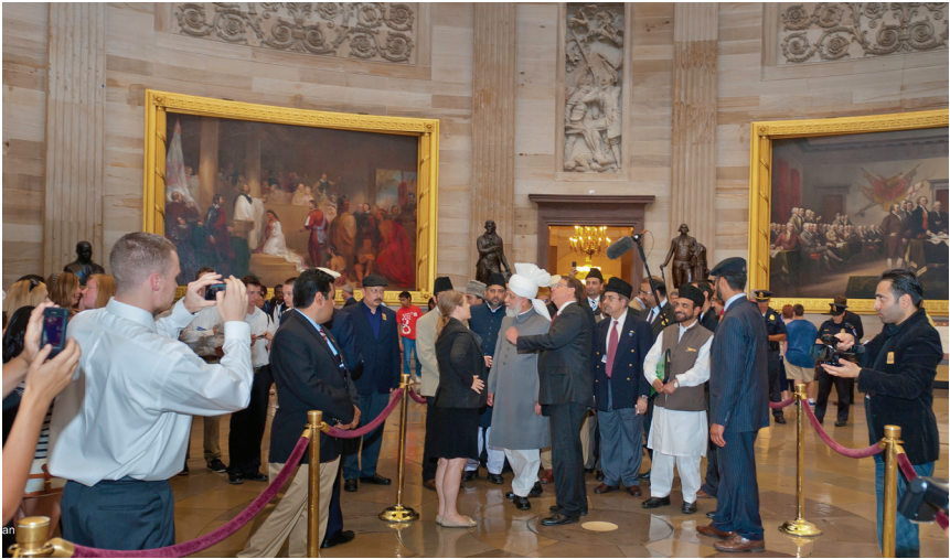
Ḥaḍrat Khalifatul-Masiḥ V rah during his official tour of U.S. Capitol Hill