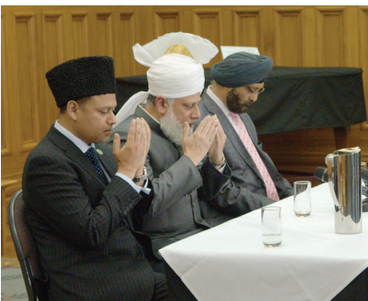
Hadrat Khalifatul-Masih Vaba leading silent prayers at the conclusion of the official function in the Grand Hall, New Zealand Parliament