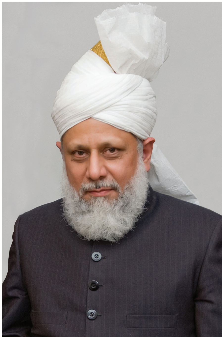
Hadrat Mirza Masroor Ahmad Khalifatul-Masih V aba