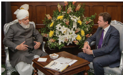
The Deputy Prime Minister, Rt. Hon. Nick Clegg in discussion with Hadrat Khalifatul-Masih V aba , House of Commons, London, 11th June 2013