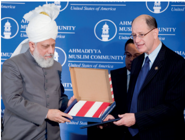
Brad Sherman (Democratic member of the United States House of Representatives) presenting American flag to Ḥaḍrat Khalifatul-Masiḥ V aba