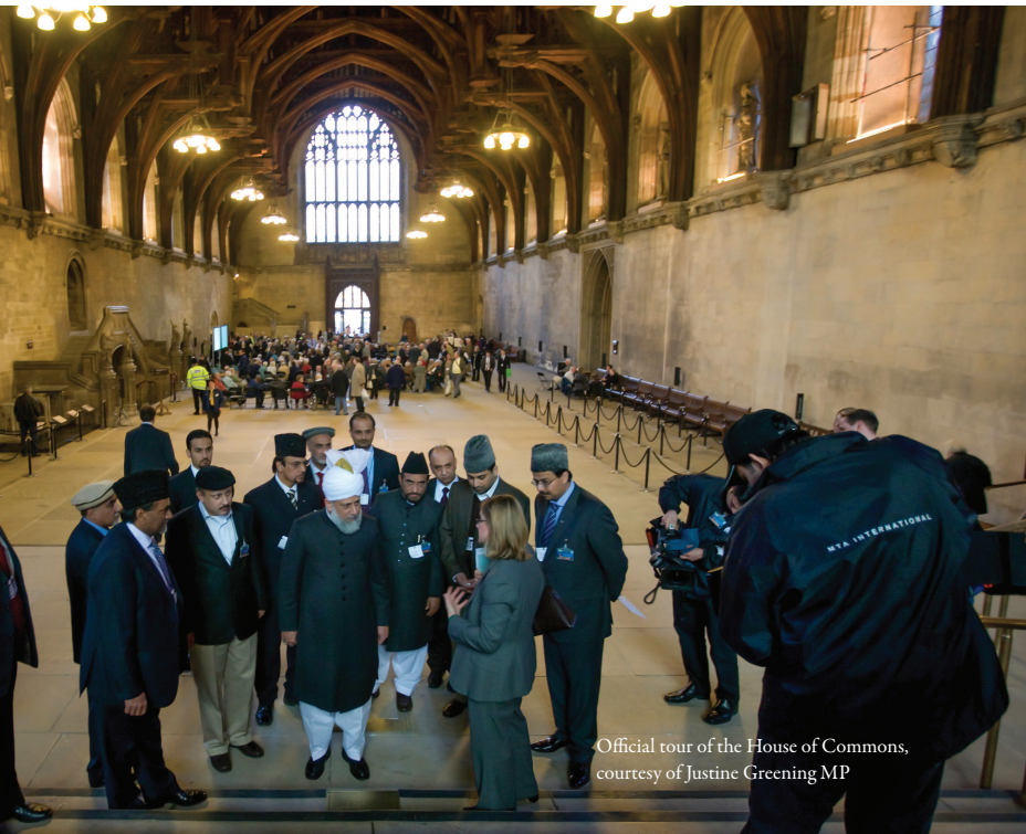
Official tour of the House of Commons, courtesy of Justine Greening MP